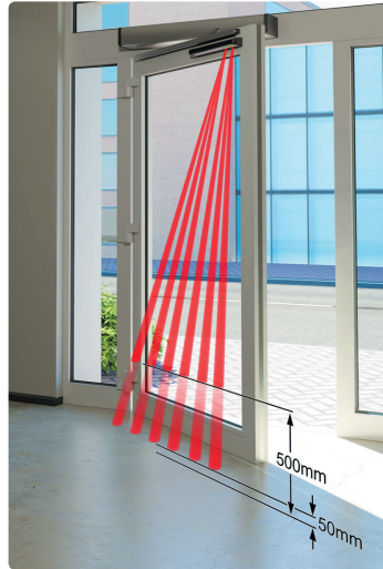
Detection Area Distance Adjustment